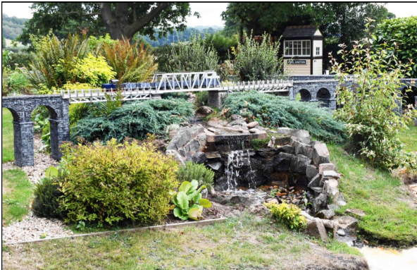
Part of the attractive 300 ft. SM32 layout.

Hosted by Sutton Coldfield Model Engineering Society Ltd.