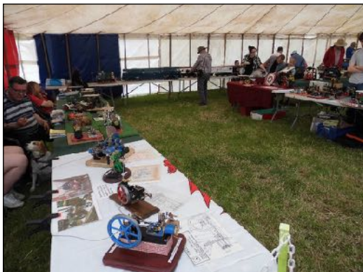
The exhibition tent.