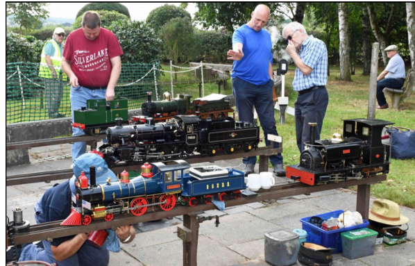
Busy steaming bays for the 480 ft. raised track.

Hosted by members of Sutton Coldfield MES Ltd on their attractive Balleney Green site at Little Hay, Saturday's records of this year's FMES Autumn Rally, held 3rd - 4th September reveal a total of 23 visitors and 13 locomotives. More would have been welcome but those of us there enjoyed an excellent day and felt sorry for absentees. We are very grateful for the efforts of SCMES members and friends who worked hard beforehand to ensure everything was ready and spent time during the event looking after their visitors.