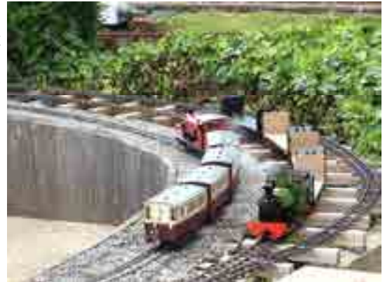
Trains on the Guildford 16mm tracks, would this entice the younger modeller?

Many Clubs and Societies are trying to promote the younger generation into