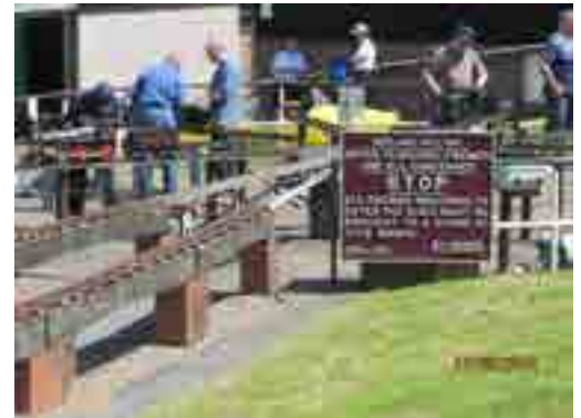
Raising steam—just love that sign!