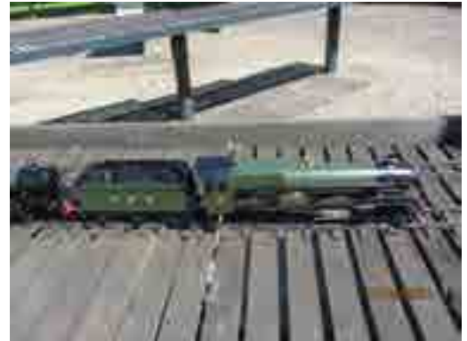
Great Western on the small gauge railway