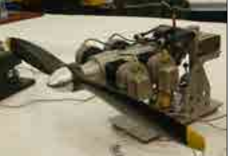
Plus examples of wonderful modelling on display this summer. More inside