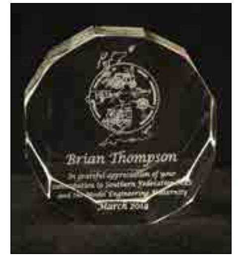
Above: Brian's engraved crystal paperweight Below: Two O-gauge locomotive carrying cases adorned with commemorative plaques.