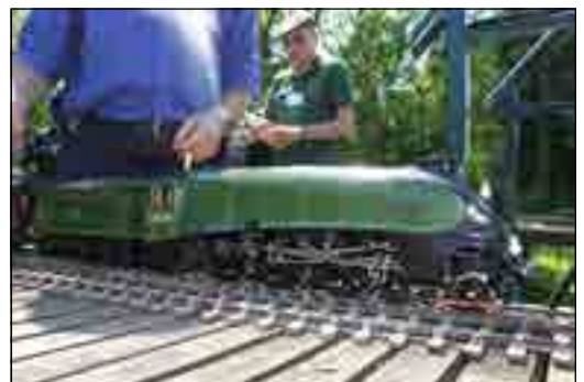
A gauge 1 locomotive in steam