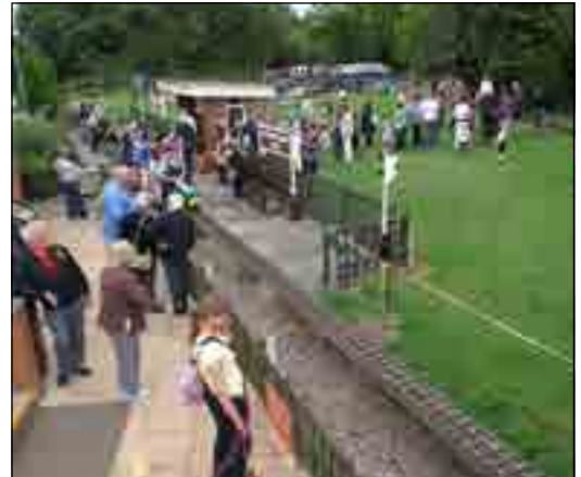
The Southern Federation Spring Rally will be hosted by the Birmingham Society of Model Engineers on Saturday 17th May 2014.

While pursuance of excellence by those in their late teens and early twenties is to be promoted, equally work by youngsters making their first steps in our wonderful