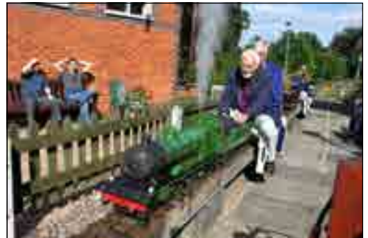
Driving on the raised 3½/5in. gauge track