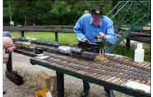
Small gauge railway facilities

Those using satellite navigation use post code B94 6DN