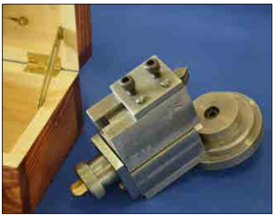
The diversity of model engineering is seen in this 'ball turning' tool exhibited by P Bowler at the recent Doncaster Model Engineering Exhibition.