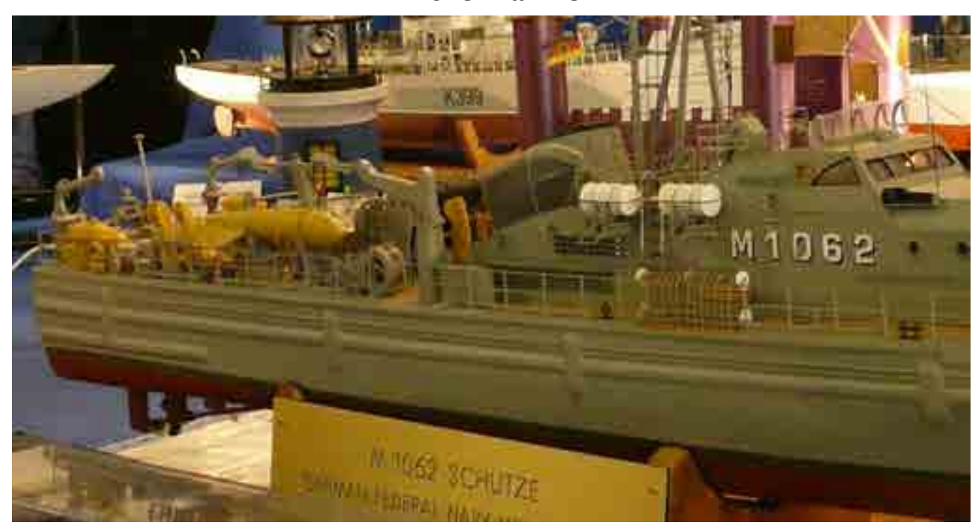
German Federal Navy Minesweeper M1062 Schultz by Stan Reffin of the Kirklees Model Boat Club . Superb detail aft with paravanes stacked up and the various lifting out gear. Notice the rib lashed up against the funnel and the liferafts ready to deploy. On the bridge is the watch officer keeping it all under control. Stan's work is highly regarded at the Kirklees Club.