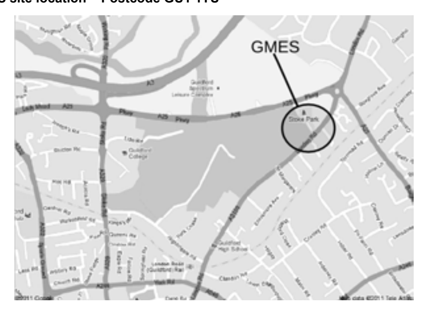
Volume 6 Issue 2.5 —Page 3